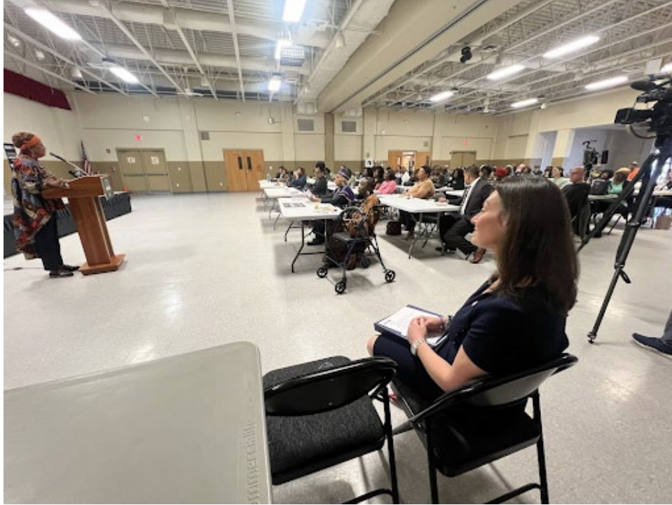
Chair Nikki Fried joins the Apopka Seniors Progressive Club for an organizing meeting to reactivate Black voters in Central Florida

The tour later stopped in Seminole and Brevard counties on week three, beginning with a visit to historic Sanford – a place with a long history of racial injustice followed by a stop in Melbourne, where Harry T. and Harriette Moore , a Florida couple active in the civil rights movement who were killed by Ku Klux Klan members in 1951. Together, they registered more than 116,000 Democrats, making Florida the state with the highest number of registered Black voters, far more than any other Southern state at the time.