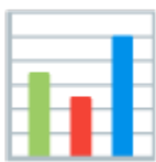
Voter Contact Leaderboard